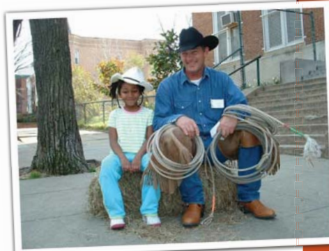
Above: Montana Rancher shares some tips on roping with a new friend. Below: NYC - May, 2007 – Libby, MT students heading to Ellis Island during their NYC rural to urban exchange experience.